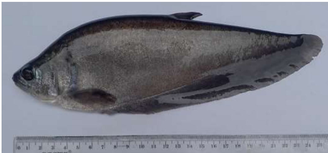
Figure 2. Specimens of Notopterus notopterus was captured on 7 September 2021 in the Brantas River, Mojokerto Regency, East Java.

The process of PCR amplification was carried out in 40 cycles. The predenaturation stage was carried out at a temperature of 94°C for 2 minutes, denaturation at 94°C for 45 seconds, annealing at a temperature of 45°C for 45 seconds, extension at 72°C for 1.5 minutes, and final extension at 72°C for 10 minutes. This cycle is repeated 40 times using Biosystems™ Veriti™ 96-Well Thermal Cycler (Thermo Fisher Scientific). After the DNA amplification process, 2% gel electrophoresis was used to visualize and check the DNA extraction result. Electrophoresis was carried out by taking 4 µl of amplified DNA which was inserted into an agarose well, dissolved in the TAE buffer then stained using GelRed™ and could be electrophoresed at a voltage of 110 V for 20 minutes. The mtDNA sequence analysis was performed on sequencing machine, ABI 3500 Genetic Analyzer (Thermo Fisher Scientific).